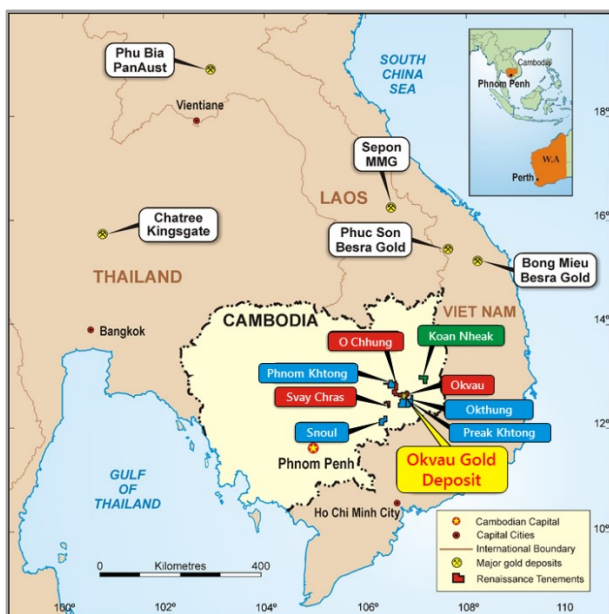
Figure 1 | Cambodian Gold Project | Location