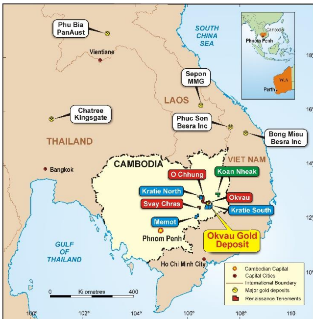
Figure One | Cambodian Gold Project | Location