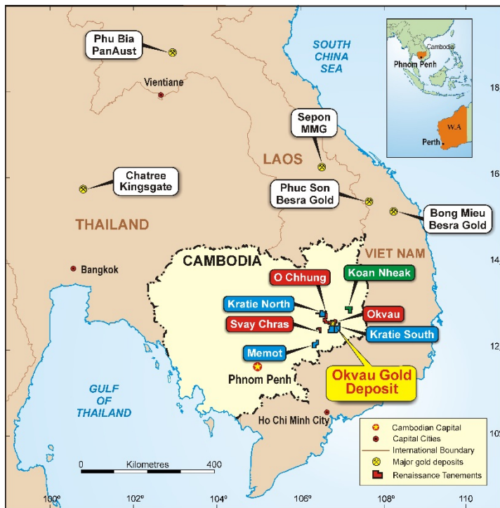
Figure 1 | Cambodian Gold Project | Location